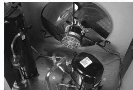
Typical Outdoor Unit with throwaway liquid-line filter and sight glass