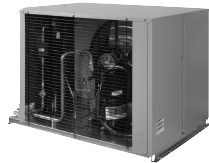
Typical Outdoor Hermetic Unit